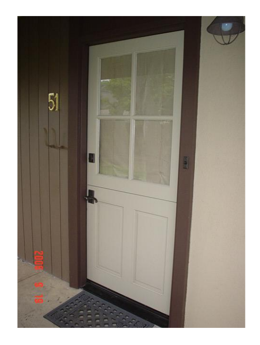
Dutch Door w/ Glass