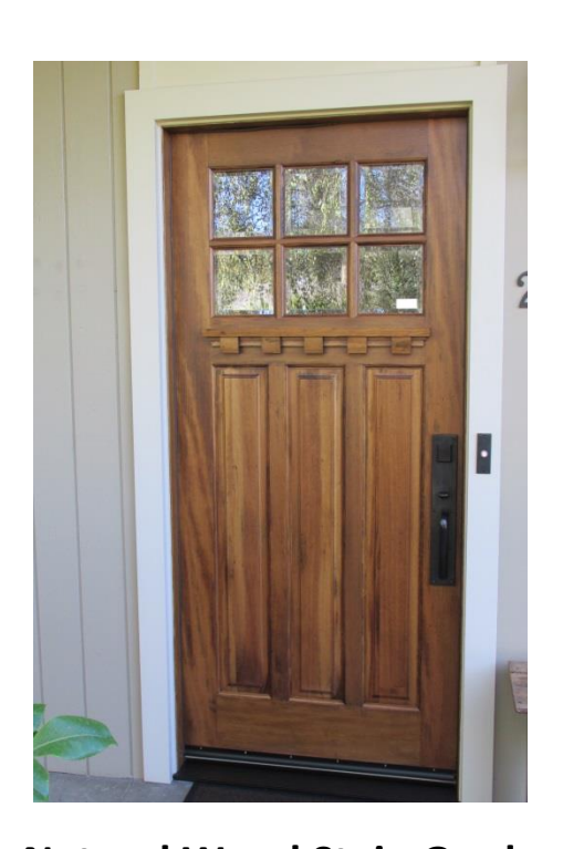
Natural Wood Stain Grade

All doors must be solid core and painted approved Hacienda colors with Kelly-Moore brand paint. Door color samples are available for viewing outside the maintenance shop located behind Casa Central. Stain color sample for natural wood doors to be submitted with request form. Once installed it becomes the owner's responsibility to maintain the door.