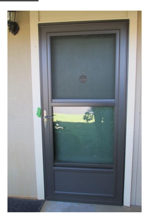
Metal Frame Screen Door with pull-down upper glass panel