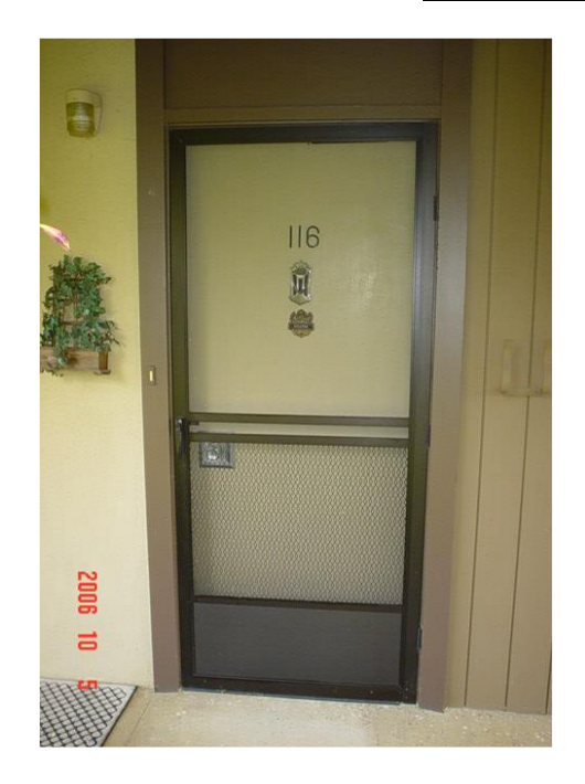
Aluminum Screen Door Bronze Color