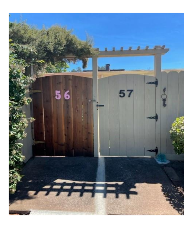
Arched Gate – Stained Natural or Painted (Shown with optional approved trellis feature)

Gates painted the standard Hacienda fence color (Kelly Moore KM-171 Sand Pebble) will be maintained by the Association. Gates that are stained natural or painted with the non-standard color become the responsibility of the owner to maintain.