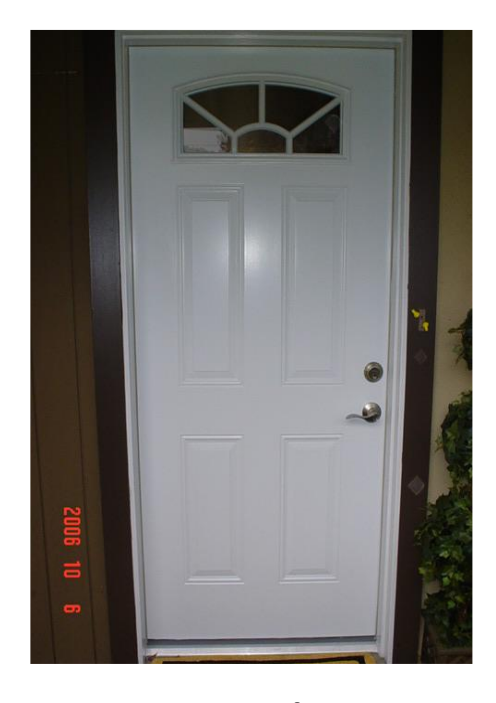
Raised Panel w/ Windows