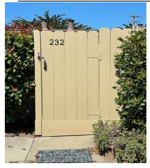
Standard Gate Matching Fence (Paint color: Kelly Moore KM-171)