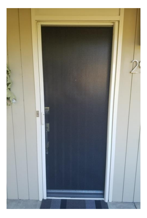
"Phantom" Retractable screen Door Frame to be "Almond" color.

Once installed, screen doors become the owner's responsibility to maintain.