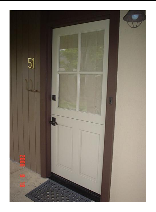
Dutch Door w/ Glass