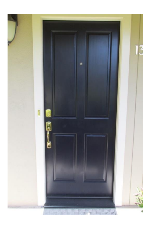
Raised Panel Solid Door