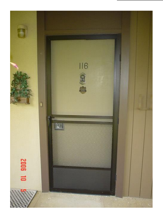
Aluminum Screen Door Bronze Color