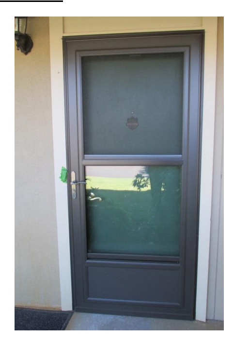
Metal Frame Screen Door with pull-down upper glass panel