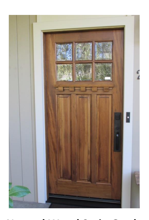
Natural Wood Stain Grade

All doors must be solid core and painted approved Hacienda colors with Kelly-Moore brand paint. (Oyster #26 / Sequoia Redwood #159 / Dark Night #AC 253 / Ellis Mist #HL 4229) Door color samples are available for viewing outside the maintenance shop located behind Casa Central. Stain color sample for natural wood doors to be submitted with request form. Once installed it becomes the owner's responsibility to maintain the door.