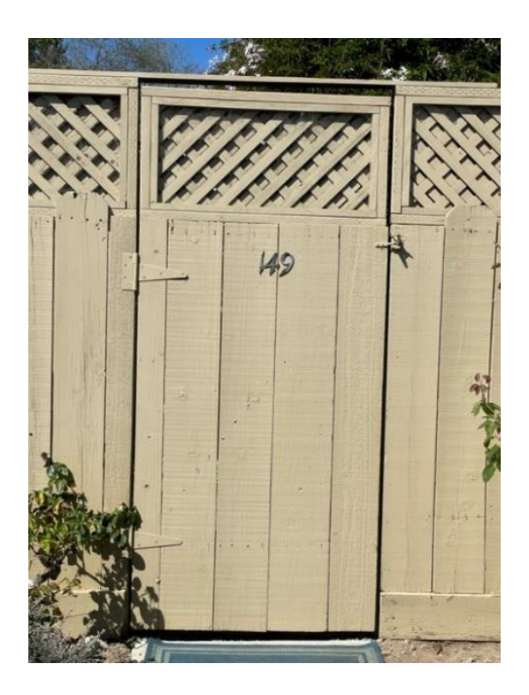
Standard Gate with Lattice (Must match lattice on fence)