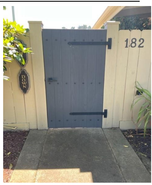
Painted Gate — Charcoal Gray (Paint color: Kelly Moore KM-4881-3)